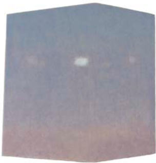
Setsuya Kotani, Untitled , 2012, acrylic on wood, 8.25 x 8.25 inches