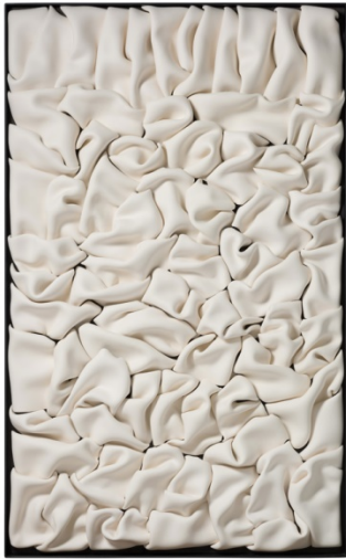
Jeannine Marchand, Puerta , 2014, clay, steel, and wood, 4 x 6 feet