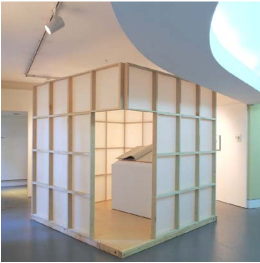
Leigh Ann Hallberg, Portable Contemplation Cube , 2016, mixed media installation, 8 x 8 x 8 feet