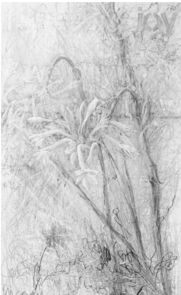
Funeral Flowers , 2014, graphite on clayboard, 19.5 x 12 inches, $1250