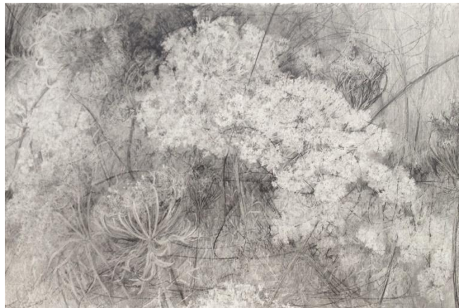
Queen Anne's Lace , 2014, graphite on clayboard, 20 x 30 inches, $2750