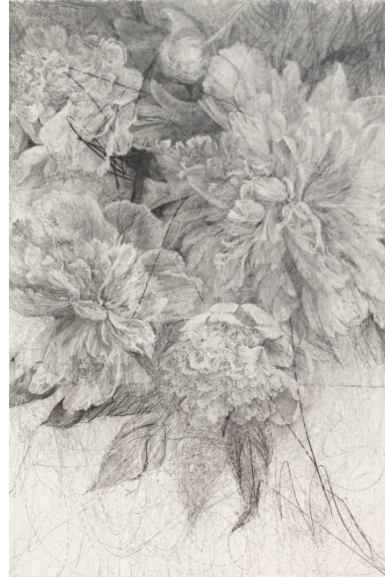
Full Bash , 2014, graphite on clayboard, 30 x 20 inches, SOLD