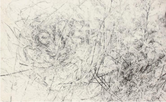
Elysian , 2012, graphite on clayboard, 7.5 x 12 inches, $375