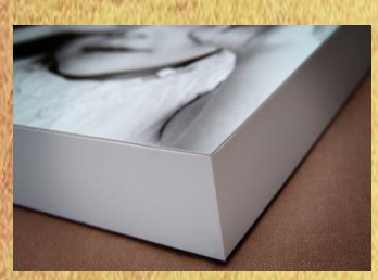
STANDOUTS Photographs are mounted (

Take your Gallery Wrap presentation to the next level with GW Collections – 5 different collections to suit your style.